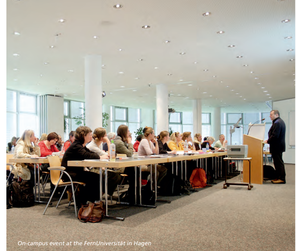
On-campus event at the FernUniversität in Hagen