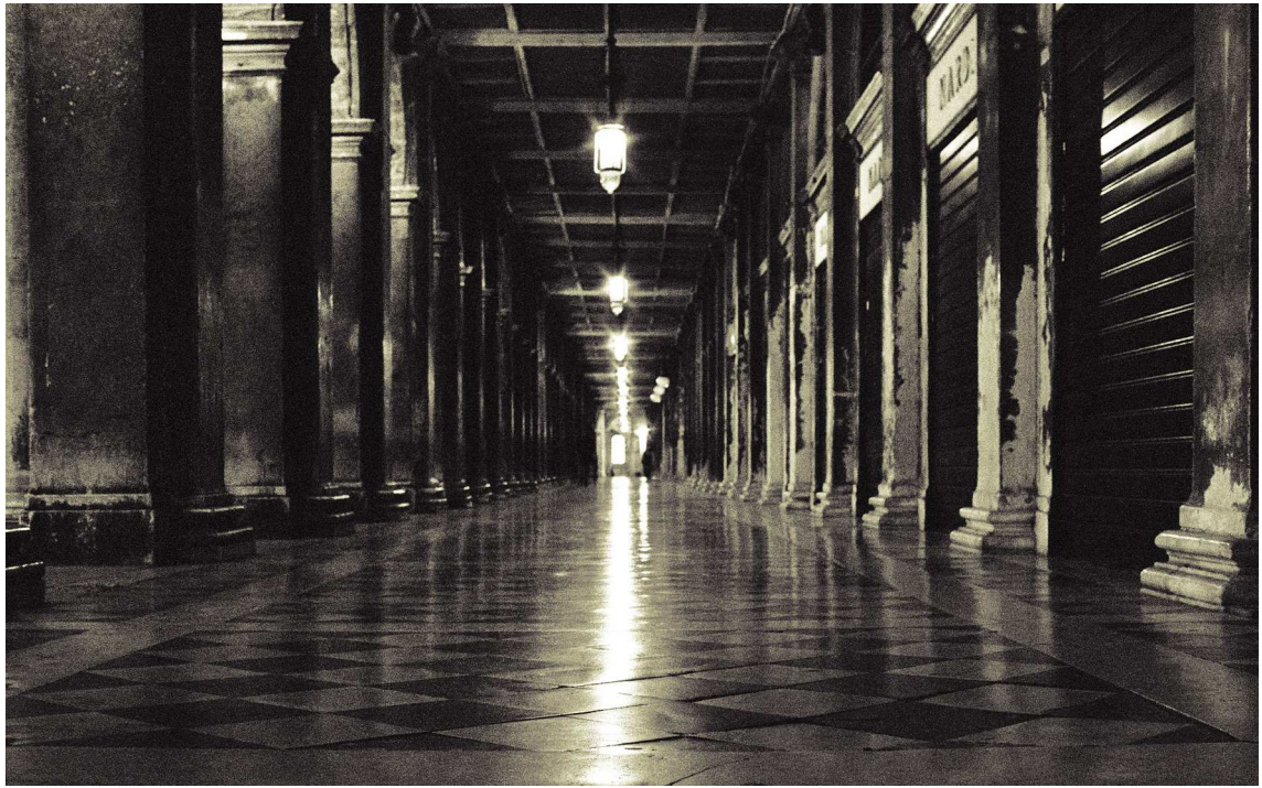
Figure 1: The Passage